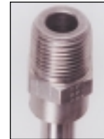
Male Pipe Thread