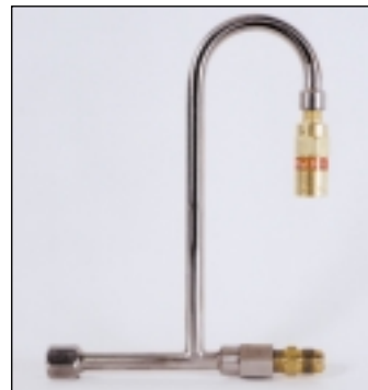
Relief Valve Assembly