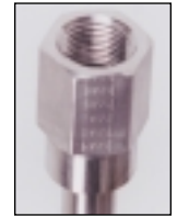
Female Pipe Thread

Other customer specified ends are available.